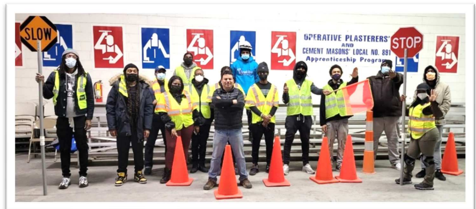
IUBAC Training Center