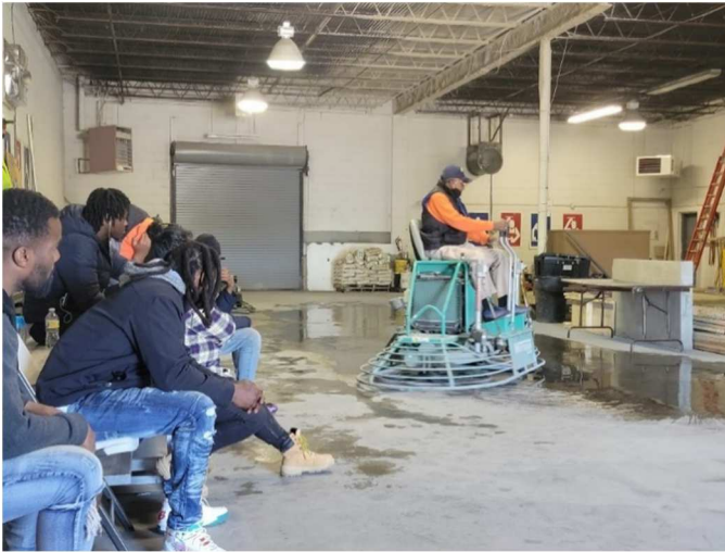
Men/Women Building Futures Pre-Apprenticeship Program