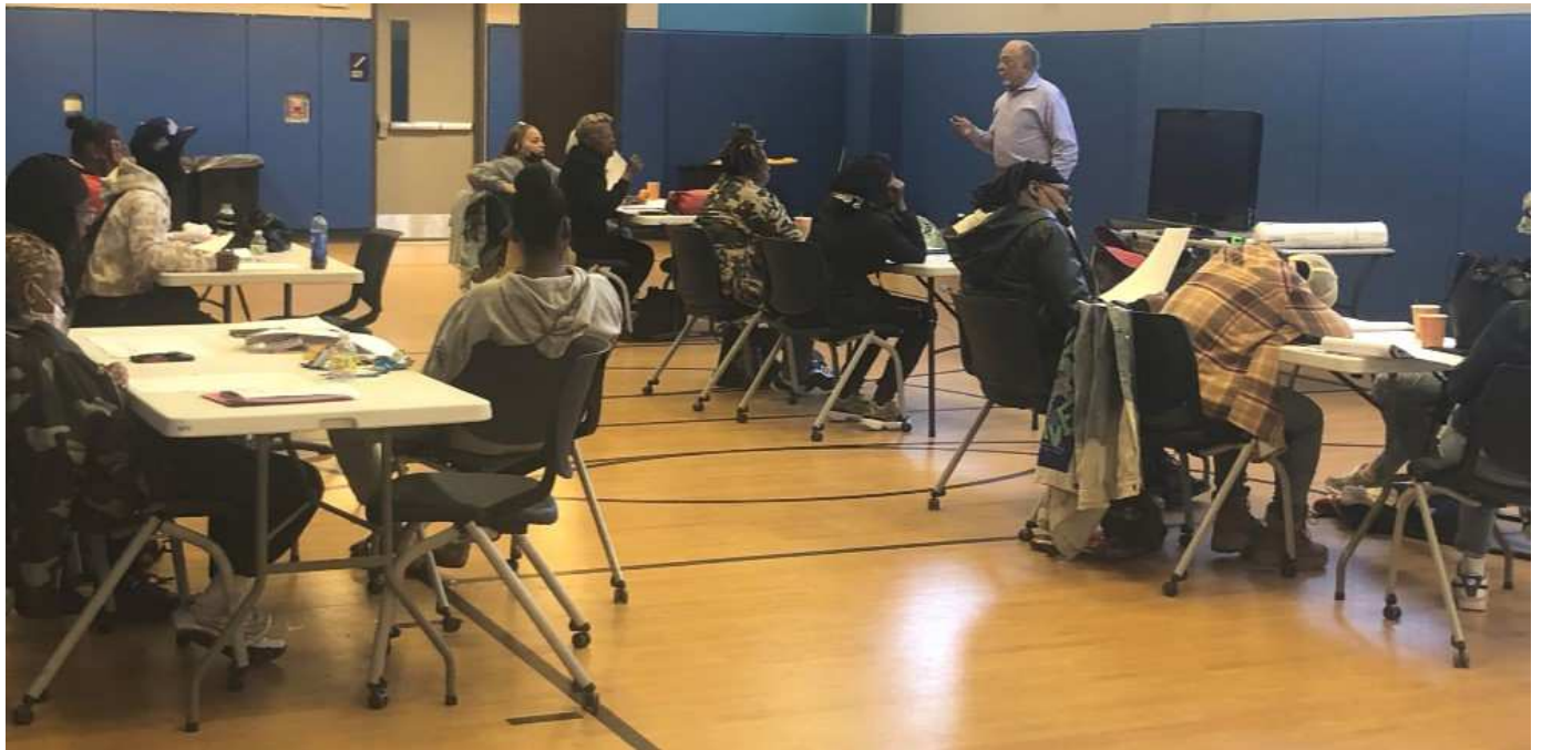
Building Futures Blueprint Reading Training