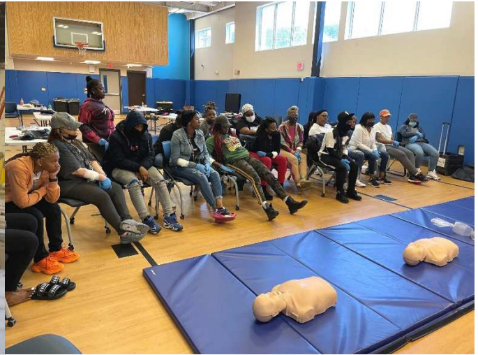
Building Futures CPR Training, All-Women Program 2022